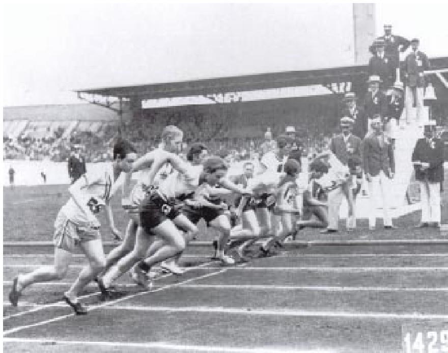
Start of the women’s 800m in Amsterdam in 1928.

The story of track and field is very enlightening in this regard. In response to the exclusion of women from track and field in the Olympic Games, Alice Milliat of France founded the Fédération Feminine Sportive de France (FFSF) in 1917 to oversee national women’s athletic competition. Four years later, she established the Federation Sportive