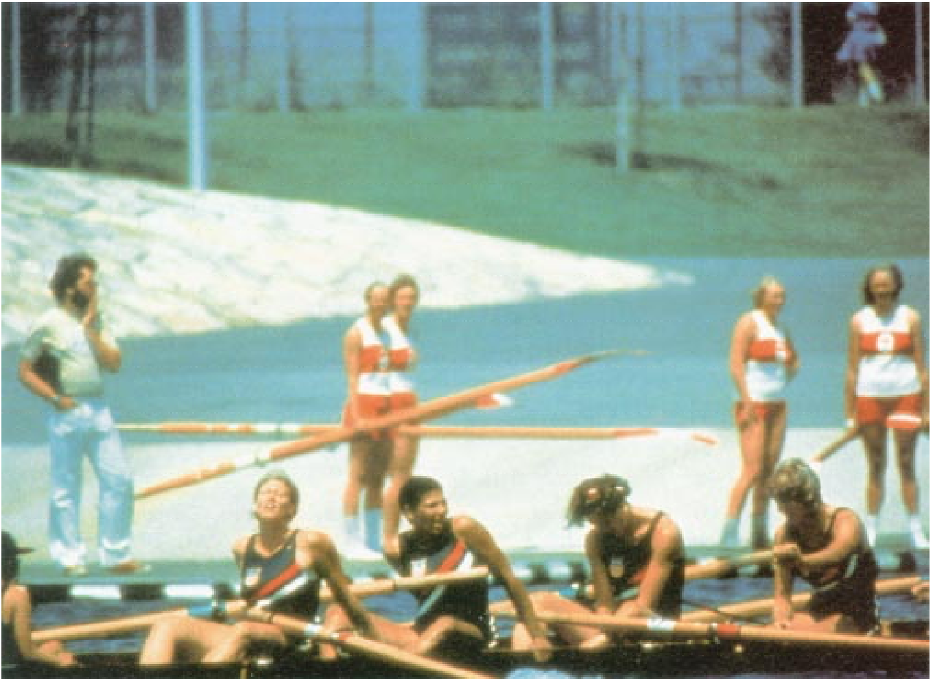
Anita DeFrantz (second rower from the left) and her bronze medal-winning team-mates at the Games of the XXI Olympiad in Montreal in 1976.

Feminine Internationale (FSFI) to include international competition. The FSFI conducted the first Ladies' Olympic Games in 1922 in Paris, and similar games every four years until 1934, and the programme of athletic events rose as high as 15, with 19 countries participating in these games in 1934 in London. In fact, the 1924 Women's International and British Games were attended by 25,000 spectators.