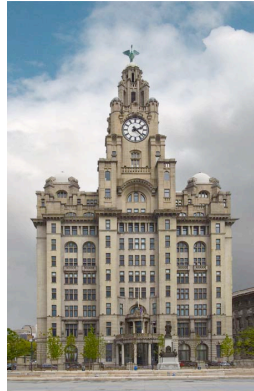
Royal Liver, Liverpool

This task is about two large circular clocks on famous buildings.