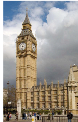
Big Ben, London

Over 100 years ago, one of the clock faces of the Royal Liver building was used as a dining table.